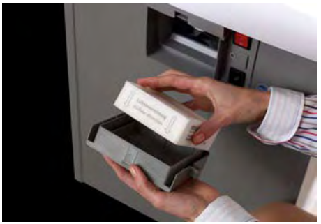
The CleanTEC* filter traps up to 98% of the fine dust, and provides a cleaner, healthier work environment.

12" Feed Opening 11/13 Sheet Capacity 1/12" x 9/16" Shred Size - Level 4 CleanTEC® Filtration Safe Technology SmartPower Management EvenFlow Lubricator