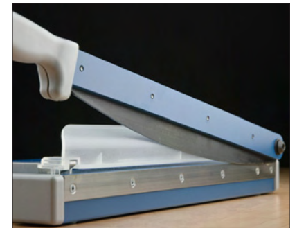
Ground self-sharpening cutting blade maintains a perfectly honed edge.