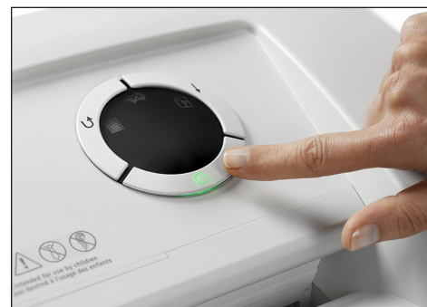
The easy-to-use command dial controls all shredder functions including power up, reverse, and continuous run.