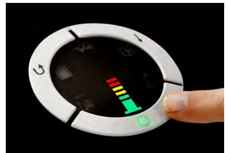
The easy-to-use command dial controls all of the shredder's functions and illuminates the proximity to sheet capacity.