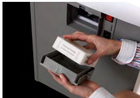
The CleanTEC® filter traps up to 98% of the fine dust, and provides a cleaner, healthier work environment.

The CleanTEC® 41322 is designed to accommodate the needs of most busy offices by shredding between 400 and 800 sheets of paper per day. It's a perfect shredder for destroying Confidential Information with this Type IIIA Dahle shredder RCMP SEG Listed.