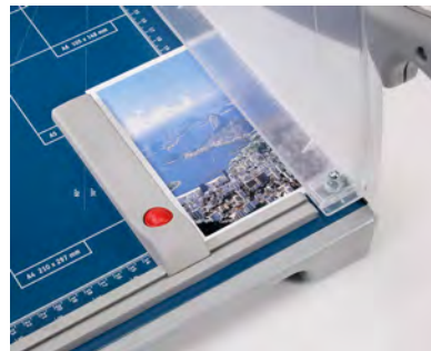
This Dahle trimmer features a manual clamp with built-in finger protection.