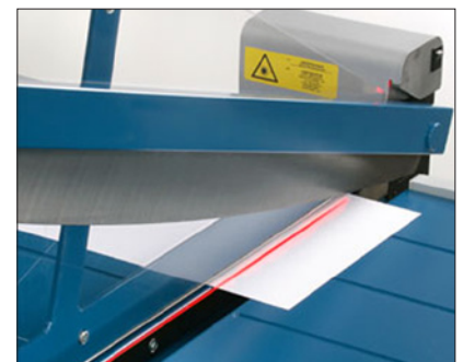
Optional laser guide ensures accuracy by illuminating the cut line across the entire cutting surface.