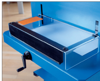
Built in safety covers on both sides of the blade prevent the blade from moving while up.